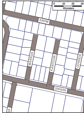
Cul-de-sac with six or more stands

The SANS 1883 project team includes representation from the following organizations: